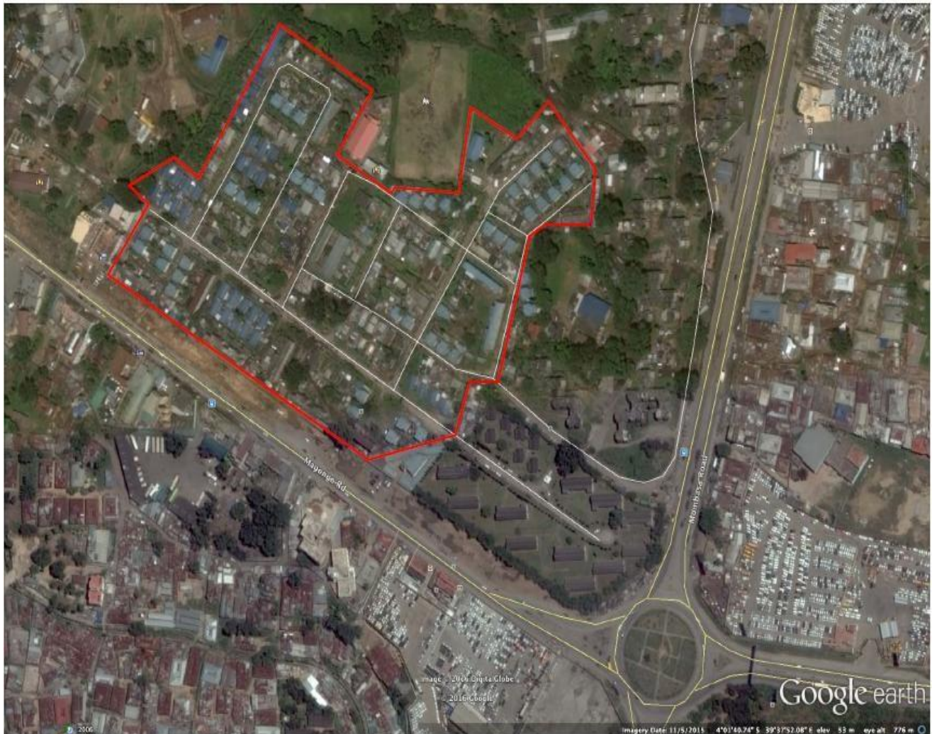
Satellite Google Map